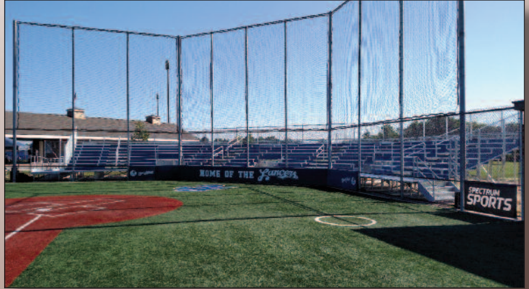
Elevated wrap-around designs