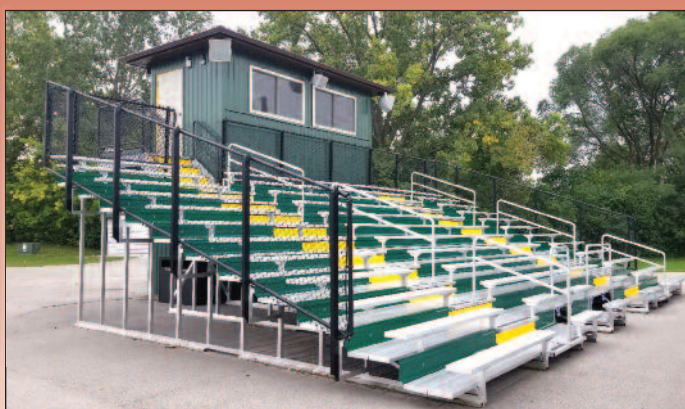
Press Boxes – see JWI Press Box Sales Sheet for more information

JWI Elevated/Custom Bleachers are manufactured in Green Bay, Wisconsin.