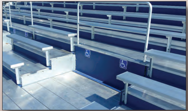
ADA Compliant Integrated Wheelchair Seating