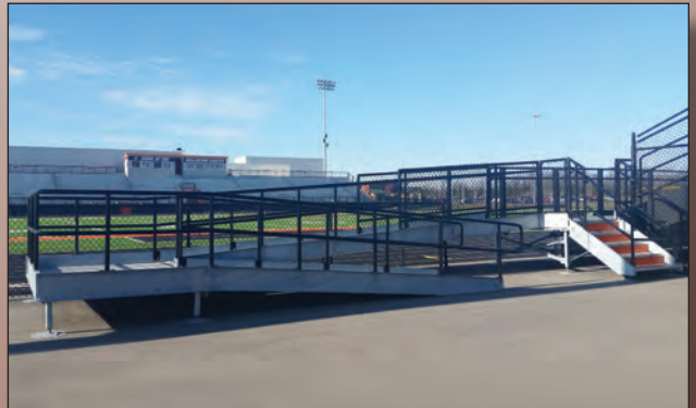
ADA Compliant Ramp System