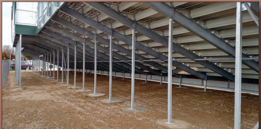
Unique Support System allows for Underside Storage