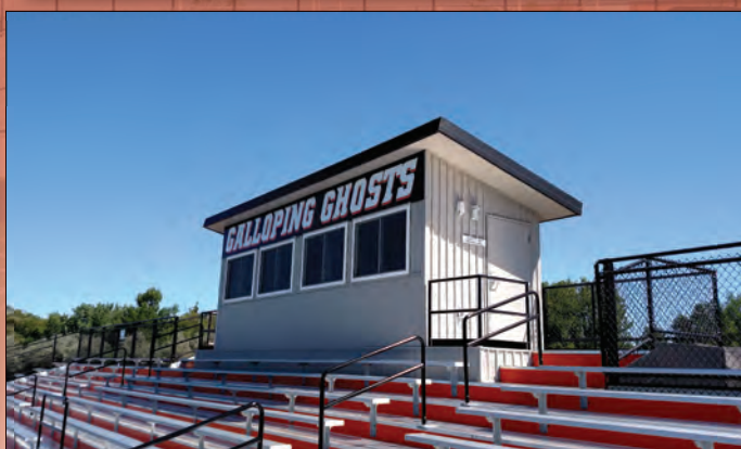
Press Boxes – see JWI Press Box Sales Sheet for more information