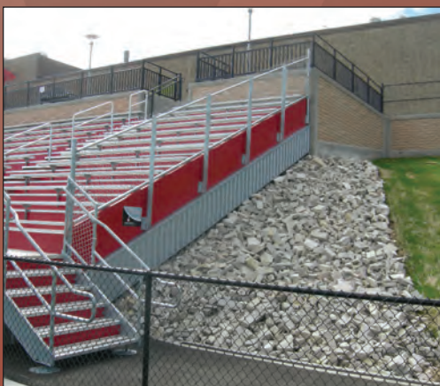
Top-Loading Design Adapts to Hillside Conditions