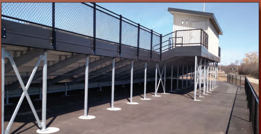
Easy Access for Clean-up